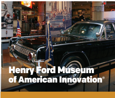
Henry Ford Museum of American Innovation®