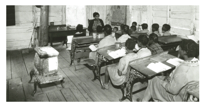
A one-room school under segregation, circa 1940. Object ID: P.B.35145

In the West, Asian Americans and Spanish-speaking Mexican Americans were also forced to learn in separate, inferior schools. In the last decades of the 1800s, the government forced many Native American children to move away from their families to boarding schools where their traditional language, dress and customs were forbidden.