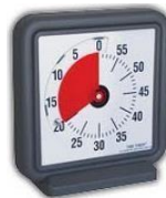
(Time Timer® visual timer)

The rail cars have open sides and I have to keep my hands, feet, and body INSIDE the car and stay in my seat...this will keep me safe when the train is moving. I will be very excited on the train, but have to remember to not shout near other people—it might hurt their ears.