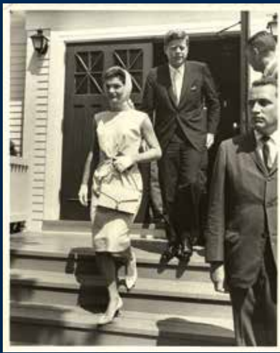
▲ Keeping a watchful eye as President John F. Kennedy and Jacqueline Kennedy exit St. Francis Xavier Church in Hyannis, 1961.