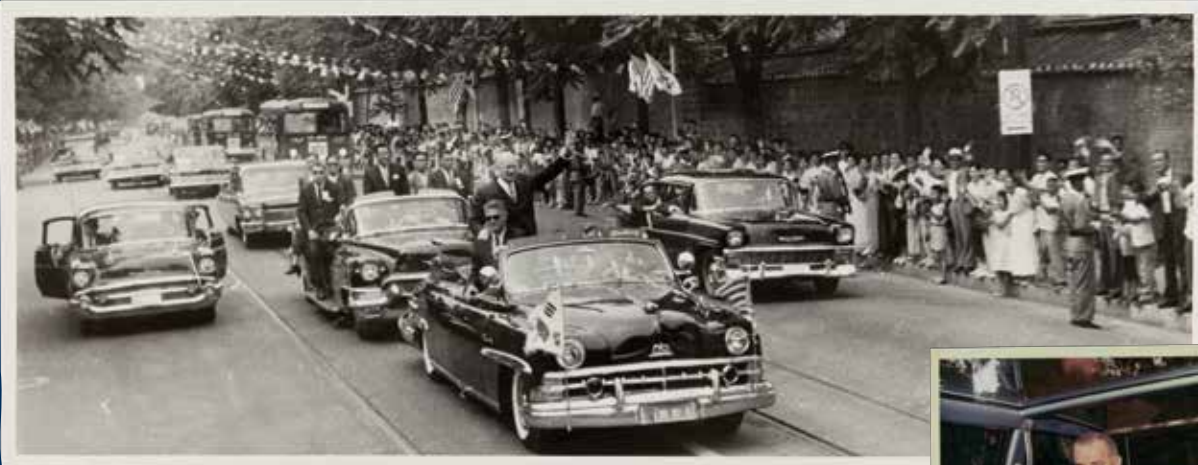
▲ President Dwight D. Eisenhower waves from the 1950 Lincoln Continental presidential limousine, Seoul, South Korea, 1960.