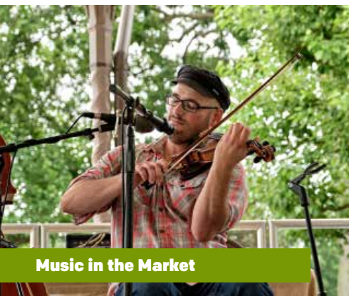
Music in the Market

LEARN MORE ABOUT FEATURED PROGRAMS AND EXHIBITS IN 2026 AT THF.ORG.