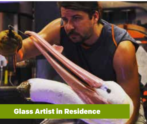
Glass Artist in Residence