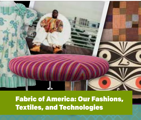
Fabric of America: Our Fashions, Textiles, and Technologies