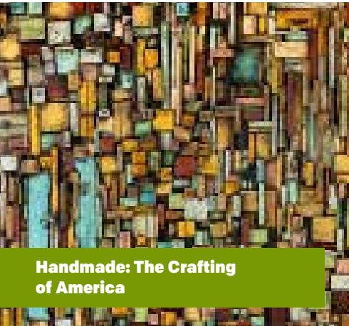
Handmade: The Crafting of America