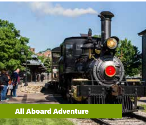
All Aboard Adventure

Free with digital corporate membership pass or included with village admission.