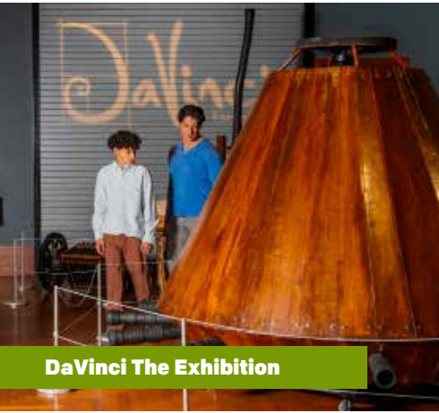
DaVinci The Exhibition