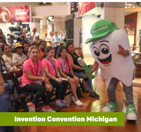
Invention Convention Michigan