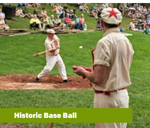
Historic Base Ball

Free with digital corporate membership pass or included with village admission. Reservations required to tour the Jackson Home.