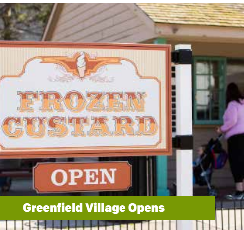
Greenfield Village Opens