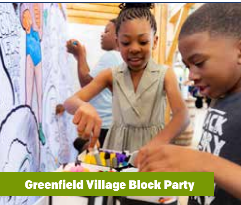
Greenfield Village Block Party

Free with digital corporate membership pass or included with museum admission.