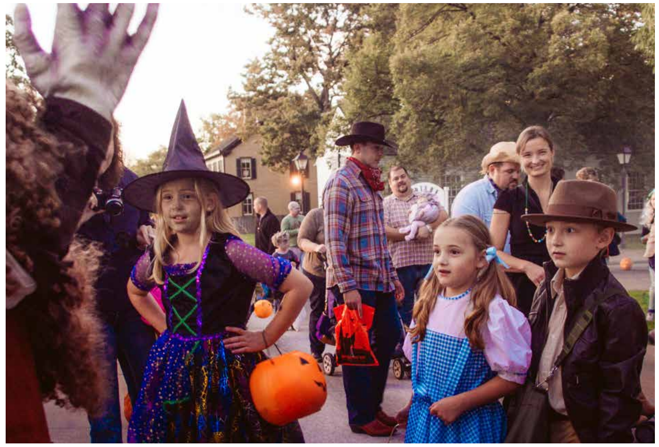
In 2013, thrill seekers of all ages got into the haunting spirit of Hallowe'en in Greenfield Village, which was supported by Ford Motor Company Fund, Michigan Education Savings Program, Better Made and the Detroit Lions. \\

Donor Roll // The Henry Ford Effect 11 10 The Henry Ford Effect \\ Donor Roll