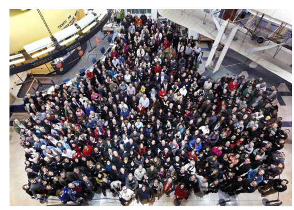
All Staff Conference Photo 2014