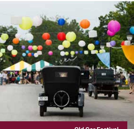
Old Car Festival

Free for corporate members with a digital membership pass. Reservations required.