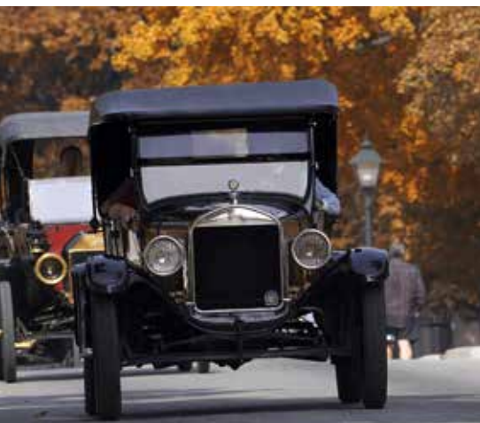
Model T Rides

At Greenfield Village, you get to experience transportation in early America firsthand. Take a ride in a Model T. Hop aboard the Weiser Railroad to tour from stop to stop throughout the village. And the kids won't want to miss the beautiful carousel, boasting artfully carved characters.