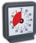
(Time Timer® visual timer)

The rail cars have open sides and I have to keep my hands, feet, and body INSIDE the car and stay in my seat...this will keep me safe when the train is moving. I will be very excited on the train, but have to remember to not shout near other people—it might hurt their ears.