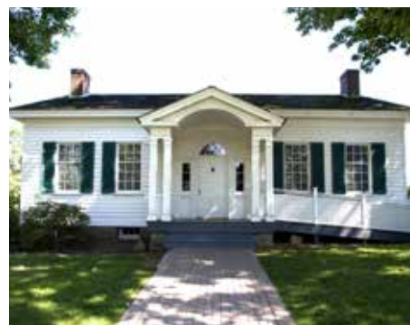
SOUNDS OF AMERICA GALLERY