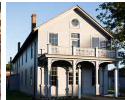
THOMAS EDISON'S MENLO PARK COMPLEX