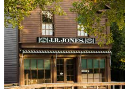
J.R. JONES GENERAL STORE