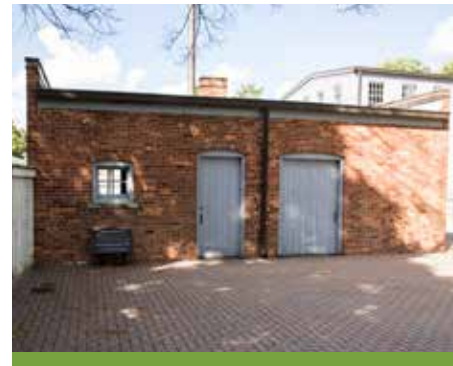
HENRY FORD THEATER/BAGLEY AVENUE WORKSHOP/FORD MOTOR COMPANY