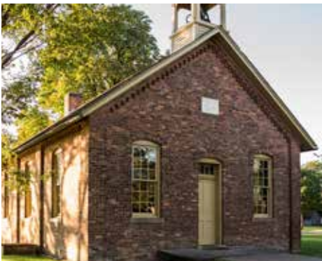
SCOTCH SETTLEMENT SCHOOL