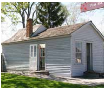
GREENFIELD VILLAGE TINTYPE STUDIO