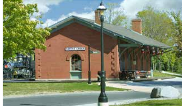
SMITHS CREEK DEPOT