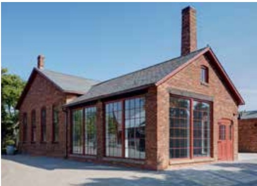
DAVIDSON-GERSON GLASS GALLERY