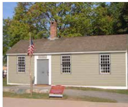
PHOENIXVILLE POST OFFICE