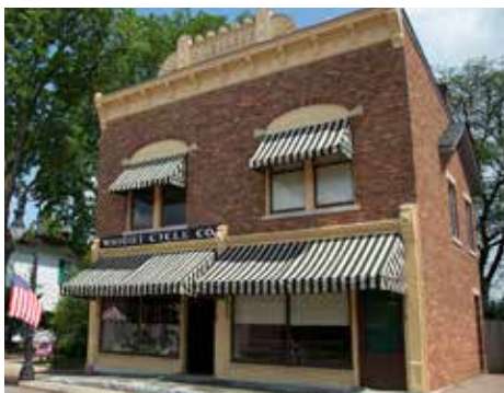
WRIGHT CYCLE SHOP