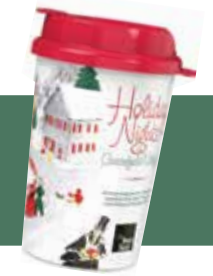
COVER: Artwork inspired by a Christmas greeting card, 1951. From the collections of The Henry Ford.

Keep your beverage toasty warm in a HOLIDAY NIGHTS REUSABLE CUP with this inspired design of a holiday card from the collections of The Henry Ford. Available where hot beverages are sold throughout Greenfield Village.