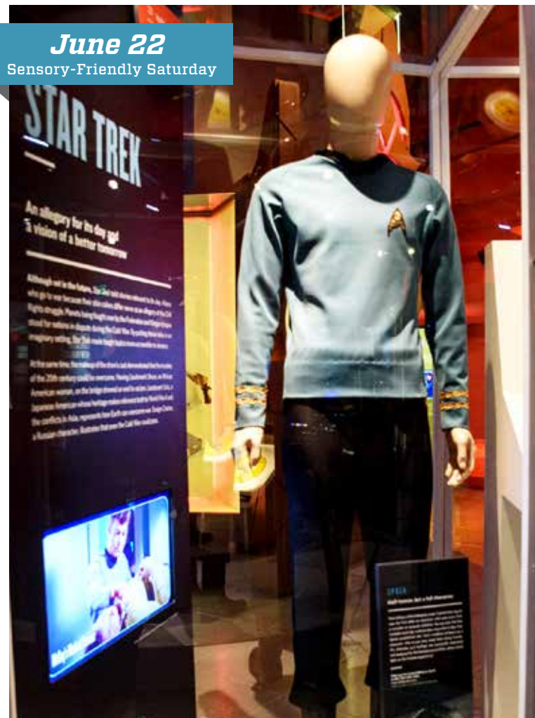
June 22 Sensory-Friendly Saturday Star Trek: Exploring New Worlds at Henry Ford Museum of American Innovation™