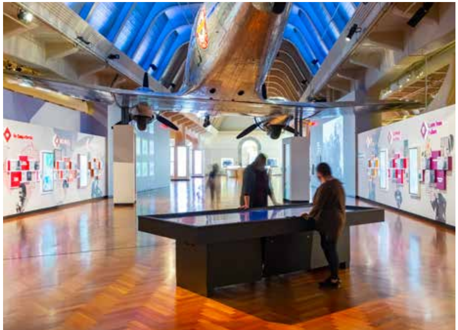
Intersection of Innovation, Henry Ford Museum of American Innovation®