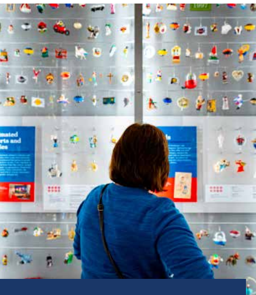
NEW! Miniature Moments