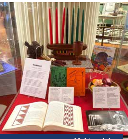
Light and Joy in the Holiday Season