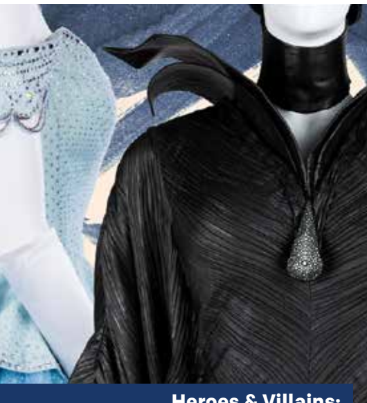
Heroes & Villains: The Art of the Disney Costume